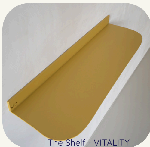
The Shelf - VITALITY