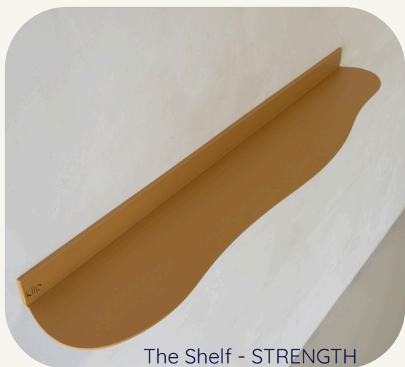
The Shelf - STRENGTH

Our 7 floating wall shelves echo the forms of natural landscapes and are available in ten colors inspired by dune environments. These hues capture the harmonious balance of Water, Fire (sunlight), Air, and Earth — the elemental forces that shape each unique form, or “Soul”, in nature, from plants and flowers to trees. This design approach reflects our belief that landscapes are more than visual inspiration — they offer a path to self-discovery.