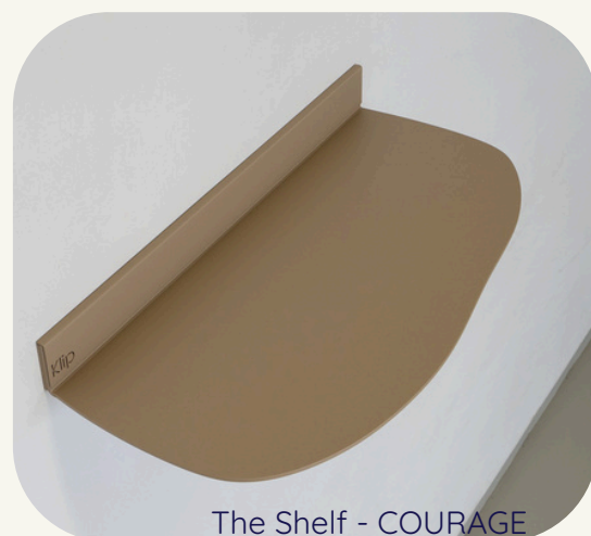
The Shelf - COURAGE

At the same time, each shelf not only reflects the shape of a landscape but also contours the forms of our internal organs. Each design subtly corresponds to a specific organ, while also recalling the shape of a natural food known to nourish that very organ. The organic lines also suggest physical movement. Just as movement and nourishing foods strengthen our internal organs, these designs remind us that nature nurtures both body and soul. By connecting the soul-searching journey through landscapes to the inner workings of the body, each form expresses a deeper truth: authentic self-discovery draws you into a life where caring for yourself becomes second nature. The shelves can be combined with The Ledge.